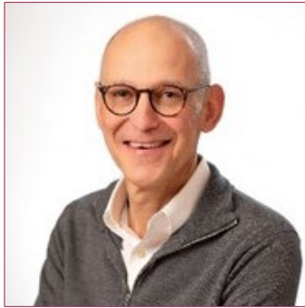
Ezekiel J. Emanuel, MD, PhD

Vice Provost for Global Initiatives Co-Director, Healthcare Transformation Institute, Levy University Professor Perelman School of Medicine and The Wharton School, University of Pennsylvania